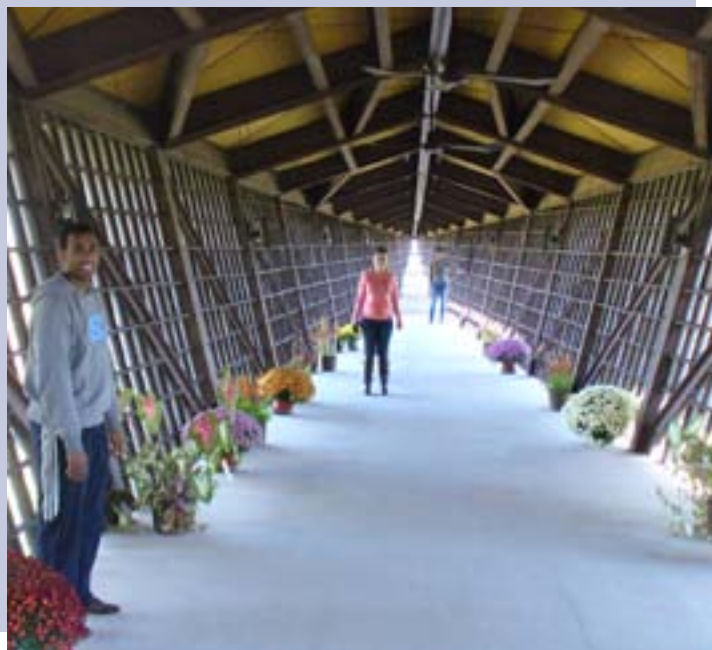
Below: McNair Scholars pose in the Infinity Room in the House on the Rocks during the WAEOPP McNair retreat in Wisconsin last October.